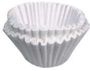
FILTERS,C GOURMET 500/2 50/CL